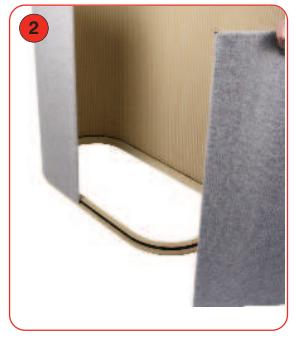
Continue to attach the wrap around the base until fully attached