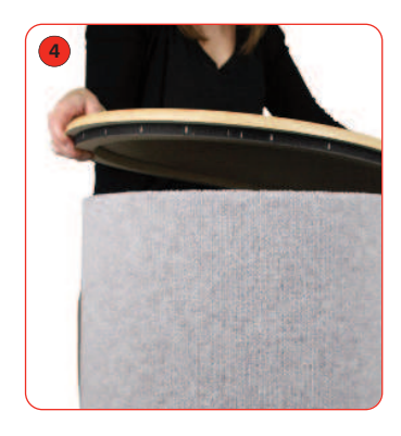
To attach the top simply lower the top into place and make sure that the hook and loop is attached all the way around