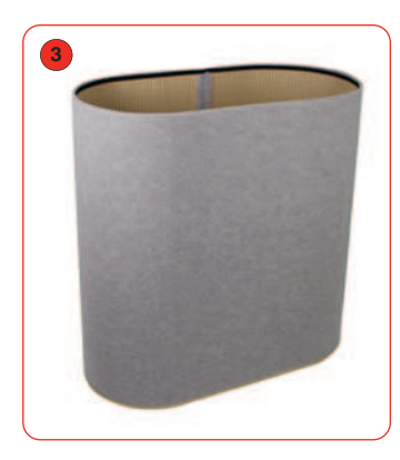
Once the wrap is fully attached make sure that the wrap is butted up against each other to make a seamless join