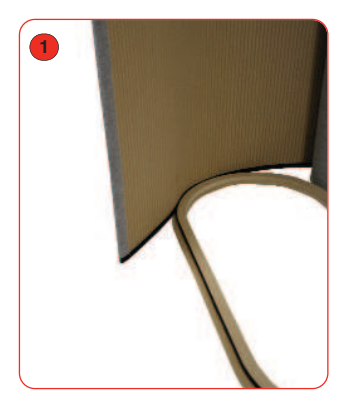
To attach the wrap place the base on the floor with the hook side facing upwards then simply locate the wrap in the centre of one side and begin to attach the wrap